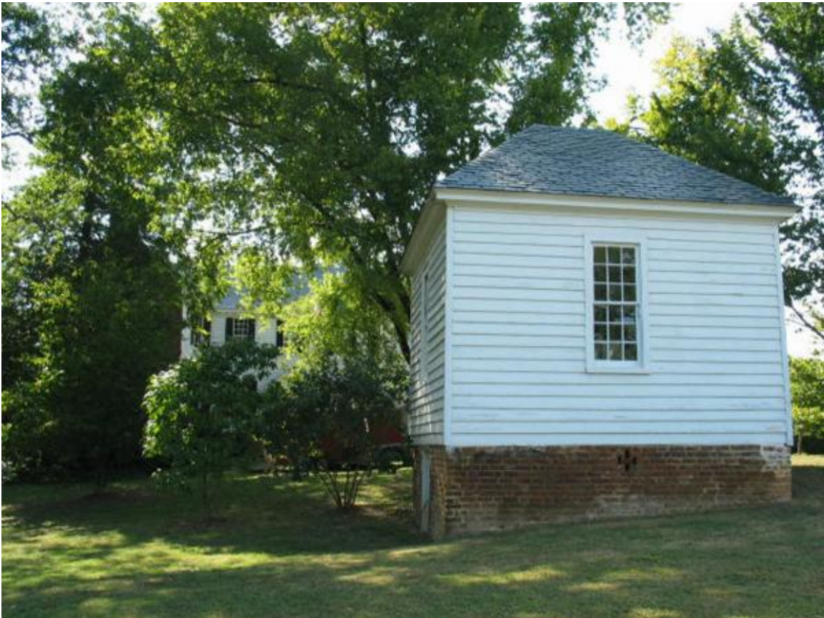
https://seaofliberty.org/print/143

Document H is a modern-day image of the Tuckahoe schoolhouse where Thomas Jefferson began his formal education as a young boy. The Jefferson family lived in Tuckahoe from 1746 and 1751. After his family moved back to Shadwell, Jefferson continued his education, boarding with rectors first in Goochland and then in Albemarle County.