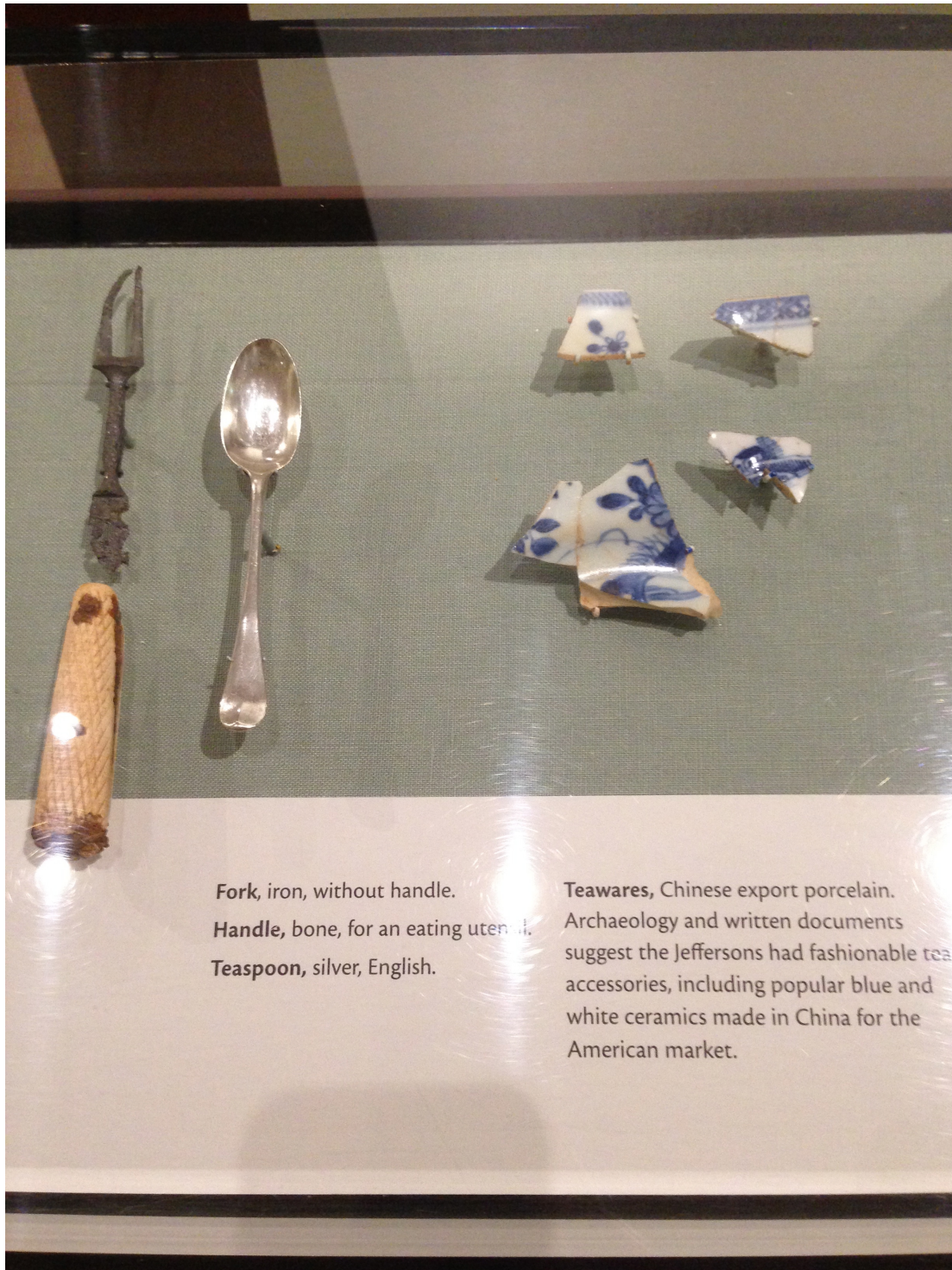
Fork , iron, without handle. Handle , bone, for an eating utensil. Teaspoon , silver, English.