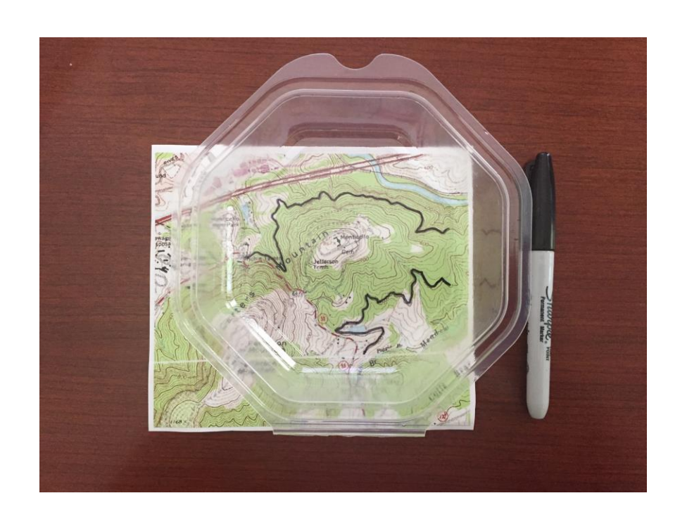
400 ft. contour interval