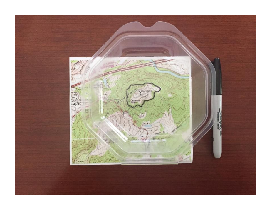
600 ft. contour interval