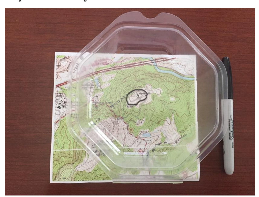
700 ft. interval on the second container.