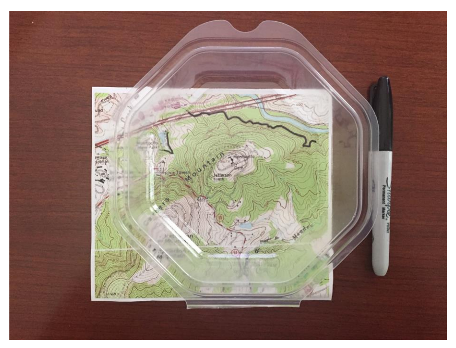
The final product