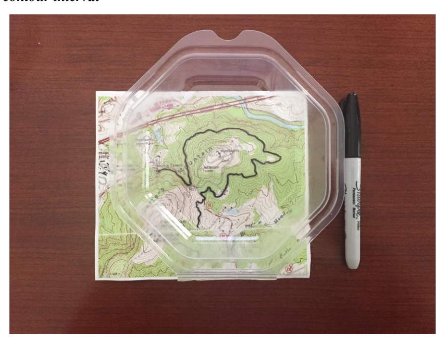
500 ft. contour interval