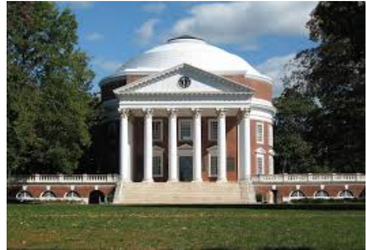
The Rotunda, University of VA